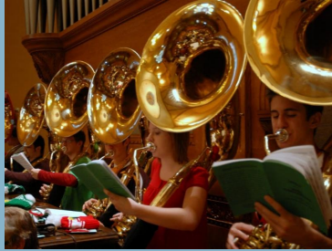
Tuba Christmas Friday, Dec 14th 5:30 FREE