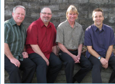
The Half Steps Sunday, Dec 16th 7:30 pm