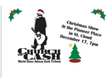
Church of Cash Christmas Show Monday, Dec 17th 7:00 pm