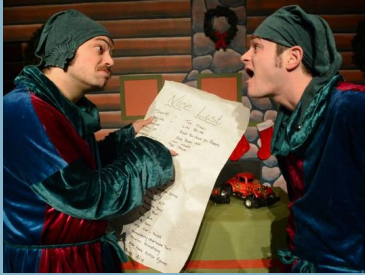
Laughing all the Way December 14th- 23rd